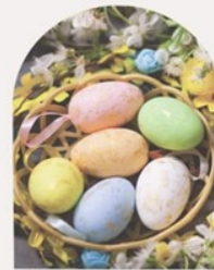
FAMILY EASTER EGG HUNT Saturday, April 4 9:00 AM