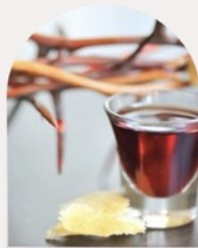
MAUNDY THURSDAY Thursday, April 2 5:30 PM