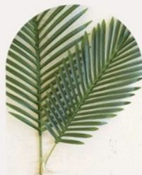
PALM SUNDAY Sunday, March 29 10:30 AM