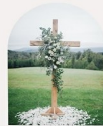
EASTER SUNDAY Sunday, April 5 Breakfast 8:30 AM Worship 10:30 AM