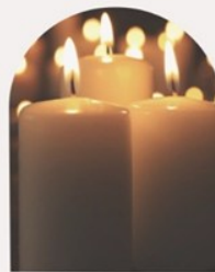
GOOD FRIDAY Friday, April 3 5:30 PM Tenebrae Service